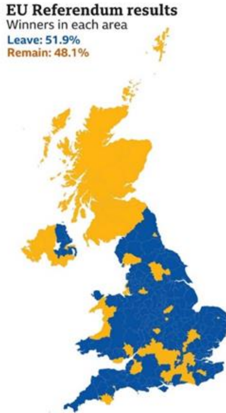
Figure 1: EU Referendum Results (2021)