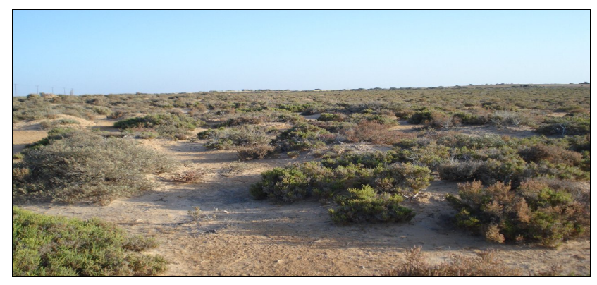
Figure 1. State of Sabkha soil (South East of Misurata city)