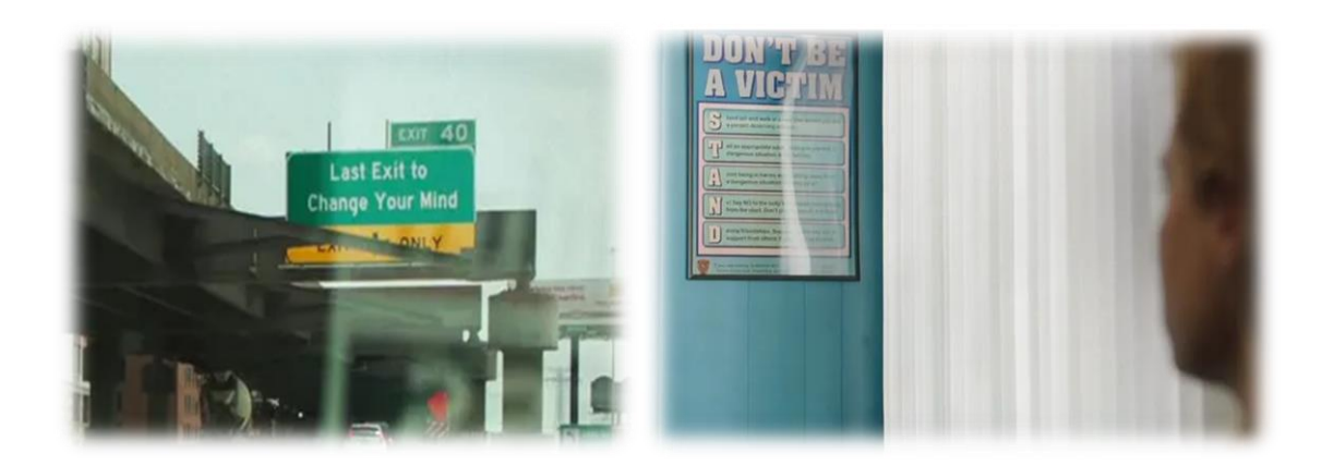
Figure 23 and Figure 24: Signs directed to Camille from Sharp Objects, Ep 1 (2018, HBO)

In Sharp Objects the connection between films and literature is different, eerie yet also creative and foreboding. Camille, the self-harmer, considers herself a book for those who were brave enough to read. Instead of words on paper Camille uses her skin to write about her agony. In the show Camille's inner thoughts are not heard as in the novel, instead the series makers found a way in which the viewers could read Camille, or more precisely read about her personal struggles. There are various words which can be read throughout the series' episodes such as "vanish" in episode one, which is both an architextual allusion and a paratext since it is also the title of the episode. The hodgepodge of the words Camille carves on her body epitomises her dissatisfaction with herself or the eeriness she felt because she did not fit in with what Wind Gap would consider a good girl. That is, a delicate girl who seeks to: look beautiful, be married and have children rather than being a self-harming journalist who investigates horrible murders. There are also words which are not necessarily written on Camille's flesh but that are still targeted towards her. For example, the camera shots mimic Camille's line of sight to show the road sign which reads "Last Exit to Change Your Mind" which Camille sees through her car's windshield, and "Don't Be a Victim" a sign Camille finds at the entrance to Chief Vickery's office (see figures 23 and 24).