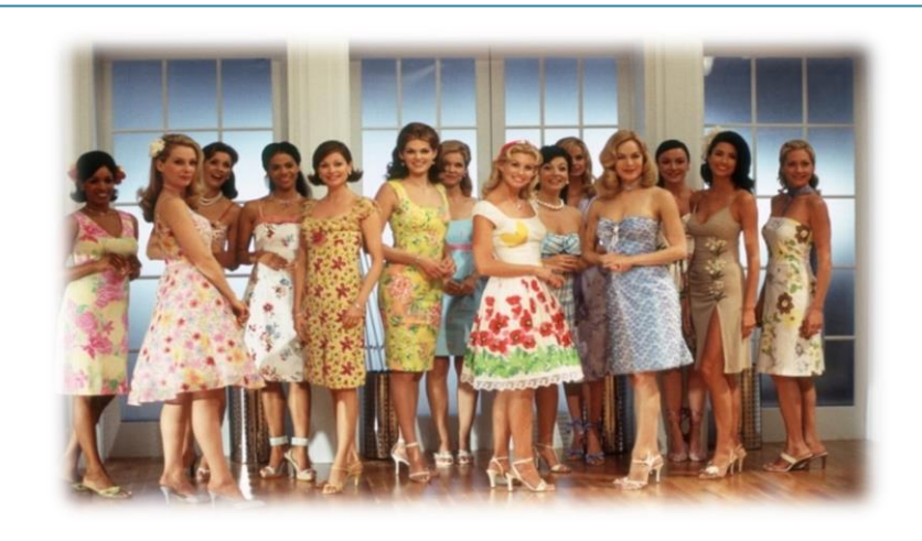
Figure 3: The Stepford women about to work out at the gym ( The Stepford Wives 2004, Paramount Pictures).