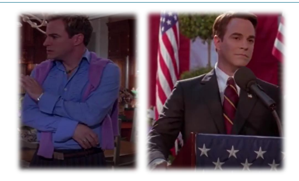
Figure 8 and Figure 9: Roger before and after his transformation into a Stepford husband ( The Stepford Wives 2004, Paramount Pictures)

Roger's character reflects a traditional gendered binary of expected behaviour within the patriarchal context that men are supposed to be manly and women feminine. As for Walter, he is, to a certain extent, similarly depicted in the film as in the novel; though the film extends his characterization to reveal more positive (pro-feminist) traits which are revealed at the end of the film. Unlike Walter Eberhart (Peter Masterson), Walter Kresby (Matthew Broderick) is not a weak man who allows his wife to be transformed into a robot. Even though there was only one mastermind who started the Stepford plan to perfect women, the husbands are the ones who accept to follow the plan and change their women. Walter, as already mentioned represents the updated 21<sup>st</sup> century men who support their women in and outside the home—an indicator that this version of The Stepford Wives reflects contemporary societal realities. In Frank Oz's version, Walter is a man in love with his strong independent woman who does not seem to adhere to Stepford's dominant patriarchal ideologies and values. Though he is depicted as the hero of the show, he is only a hero because he supported the female cause.