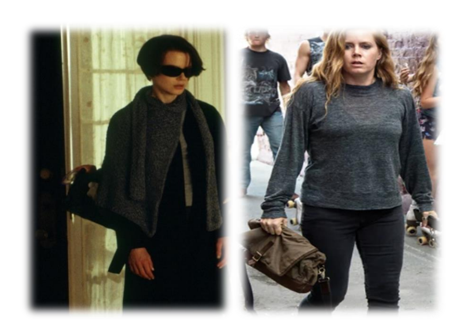
Figure 15 and Figure 16: Joanna Eberhart and Camille Preaker from The Stepford Wives (2004, Paramount Pictures) and Sharp Objects , Ep 3 (2018, HBO)

feminist movement recounts the protest" (Hillman 155). This feminist protest is an indication of some women's refusal to accept the male gaze as the defining standard of feminine ideals. In these two images from The Stepford Wives and Sharp Objects , Joanna and Camille represent, through their dark attires, the feminist refusal to adhere to the unrealistic, gendered expectations of perfection dictated by hetero-patriarchal value systems and the male gaze (see figures 15 and 16).