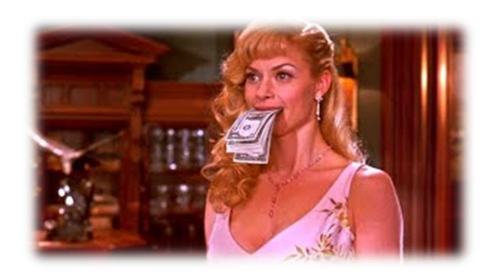
Figure 4: Mrs Sandersen providing money of her mouth like an ATM ( The Stepford Wives 2004, Paramount Pictures).

although they do not realise that it is used to control her, the audience has a privileged insight since they are able to witness that once the trio click the buttons of the remote Mrs Sunderson's body starts to transform into a robotic figure ( The Stepford Wives 34:45- 35:10). Likewise, when Walter is in the Men's Association, the men reveal that their wives are automatons. For example, when Ted calls his wife to give Walter the money he owed him, Ted's wife literraly functions like an ATM. She retrieves the money out of her mouth after inserting his credit card as evidenced in the following screen capture from that scene (see figure 4). The fact that Mrs Sandersen was rendered into a money-retrieving machine reflects a clear desire for the men in Stepford to objectify their women, not only to be good wives but to become the fulfillers of their every whim and desire. In correlation, the film reflects a severe case of injustice towards women who are being minimised into objects—a fetishization that persists into the 2000s.