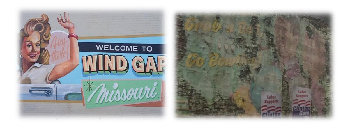
Figure 21 and Figure 22: The posters in Wind Gap in the beginning of Sharp Objects (2018, HBO)

ingrained into their own psyche. At the beginning of episode one, a paratext is included in the opening of the show as flashbacks. This paratextual tool is an assortment of scenes before the beginning of the actual story accompanying the cast and crew's names. In Sharp Objects this assortment, which is not found in novels, includes faint reoccurring images of Amma, the pigs at the slaughterhouse, woods, blood dripping, and Marian while Camille drives her car through Wind Gap ( Sharp Objects Ep.1 00:15- 01:30). These images serve as an introduction and a basis for the mystery and malice which are soon to be revealed in the story but it also introduces Wind Gap to the viewers as a blond woman from the 1950s commercials included in The Stepford Wives . This welcome sign to Wind Gap, depicts a woman as the representative of domesticity which is then juxtaposed with a faded poster which shows a heteronormative couple (see figures 21 and 22). This visual alludes to the importance of marriage has faded in town—just like the poster. This reality is seen in Adora and Alan's marriage, as already explained, Adora appears to be the perfect wife to her husband yet in reality he asks for permission to be close to her and she refuses.