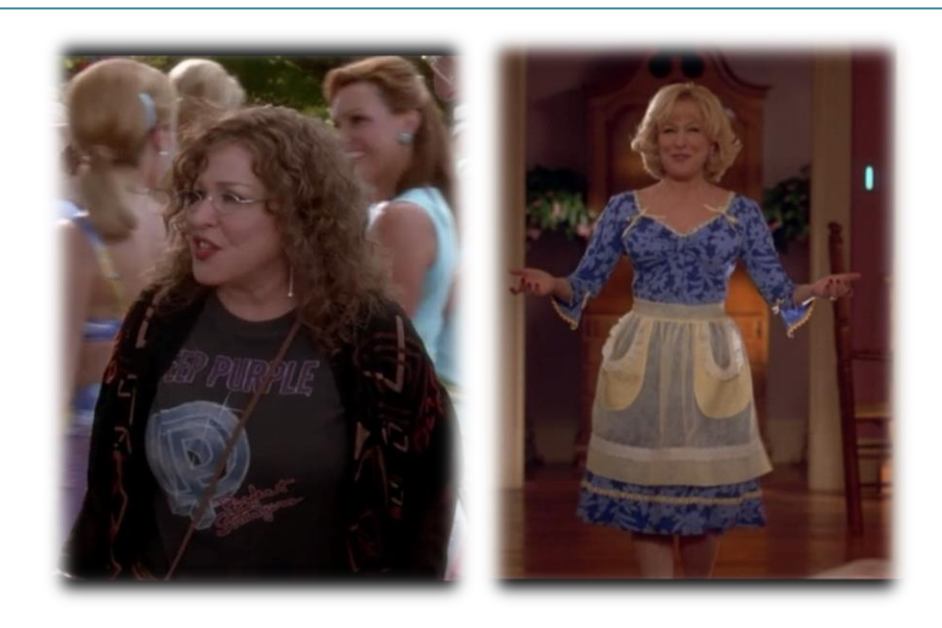
Figure 6 and Figure 7: Captures of Bobbie Markowitz before and after her transformation into a Stepford wife ( The Stepford Wives 2004, Paramount Pictures)