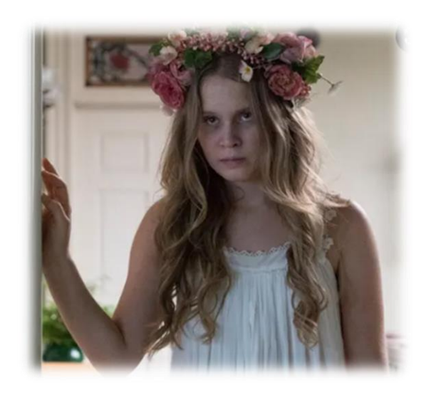
Figure 25: Amma as Ophelia from episode 8 in Sharp Objects, Ep 8 (2018, HBO).

Introduced in the second chapter of the novel, both Adora and Amma display anomalous behaviours which are believed to be closely relevant to the typology of the suicidal Ophelia as defined by Elaine Showalter. Ophelia is a literary character introduced by William Shakespeare who is known as the grief-stricken madwoman. The unstable women who were considered to belong to the Ophelia typology corresponded to a certain attire by "wearing white, keeping their hair unbound and unruly, and wearing wreaths of flowers and branches on their heads" (qtd in Sigurdardottir 5). For example, Amma is depicted wearing a white nightgown, in the last episode, with flowers as a crown on her head, disorderly hair and looking like a version of Ophelia (see figure 25).