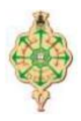
University of Tlemcen Faculty of Letters and Languages Department of English

Wicked Matriarchy behind the Scenes: On the Perfectionism of Women from Book to Screen through The Stepford Wives and Sharp Objects