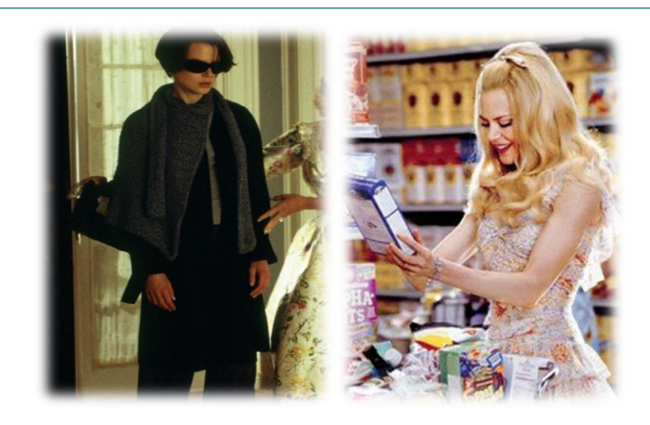
Figure 26 and Figure 27: Joanna before and after her transformation in The Stepford Wives (2004, Paramount Pictures).