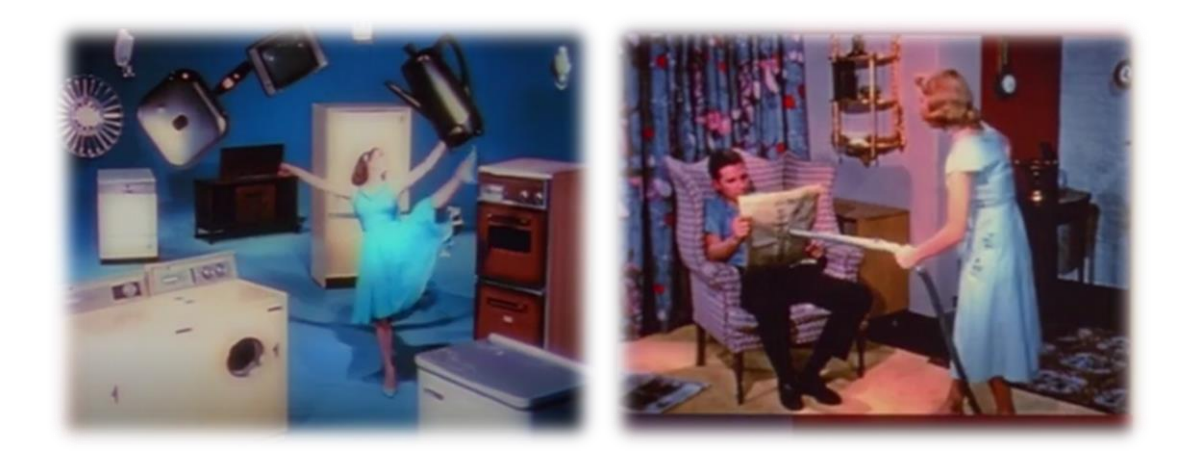
Figure 19 and Figure 20: Commercials included in the beginning of The Stepford Wives (2004, Paramount Pictures).