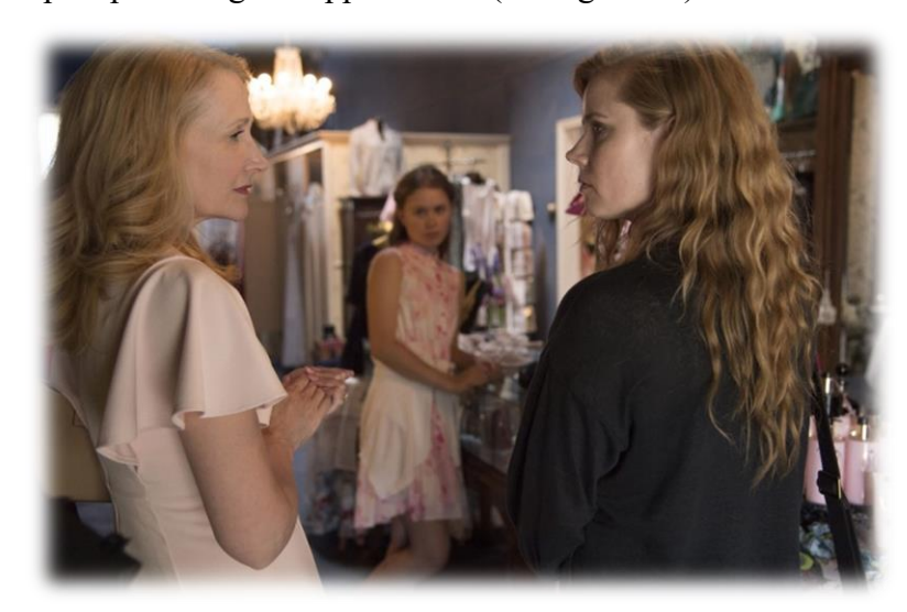
Figure 14: Camille, Amma and Adora at the clothes' shop. (Sharp Objects 2018, Ep 5, HBO)

Adora's reply shows that she wanted to be distinguished from her daughter as if she did not belong to her and, like Claire, she hinted at the disapproval of seeing girls wearing predominantly black colours. Despite not being mentioned in the dialogue, the viewers can see that what Adora hinted on by the word colouring meant Camille's dark attire in contrast to Amma's and the shopkeeper's brighter appearances (see figure 14):